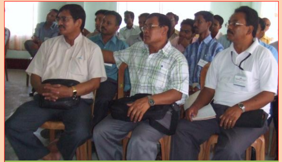
Pastors & Church leaders

As an extension of His ministry to India among the Nepali and Nepali speaking people churches, TEACH India is playing a great role. They are reaching all the states of North-east India . The coordinator (left picture) has a great passion to serve among the churches there. Before, she was sent for 3 years contract but now she doesn't want to come back to Nepal. Praise the Lord for her passion! She felt a burden for India and works incredibly hard to strengthen the